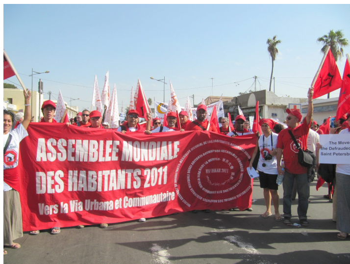
The inhabitants at the opening march WSF Dakar 2011