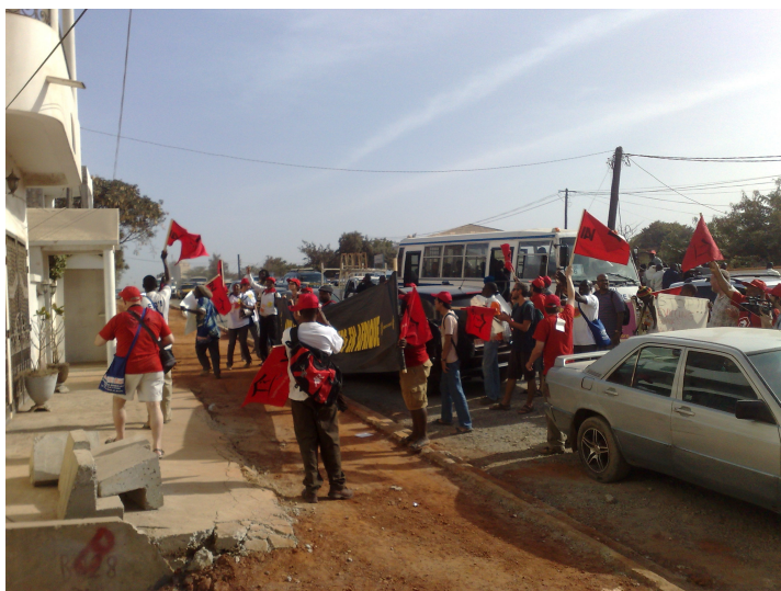
Demonstration against evictions in front of the Ghanaian Embassy Dakar 8 February 2011