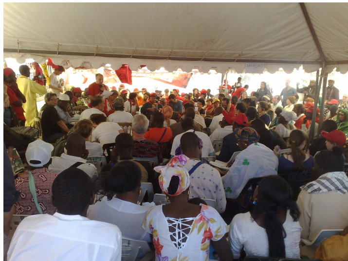
Reading the Dakar Declaration at Village des Habitants