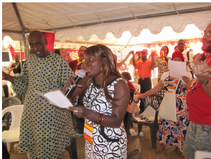
Singing the Inhabitants Anthem (WAI, Dakar February 10 2011)