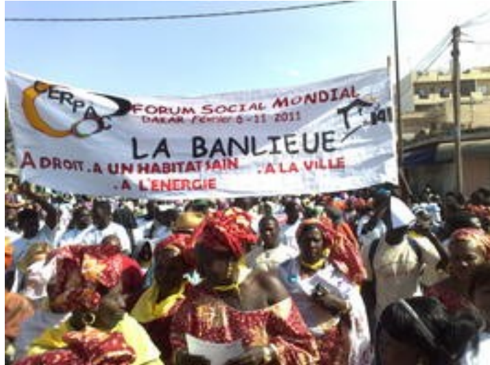
From the popular neighborhoods of Dakar to the World Assembly of Inhabitants