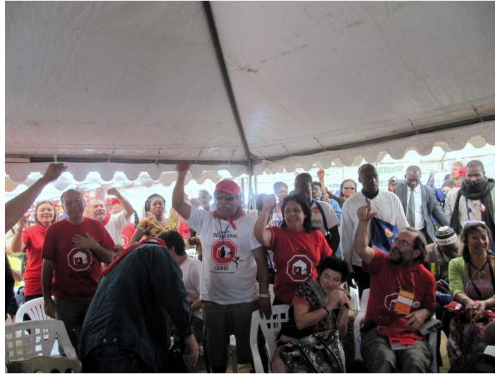
The approval of the Dakar Declaration at Village des habitants

The Assembly took place with a certain number of initiatives, some of which were self-managed by the various networks and inhabitants' organisations, some were in collaboration (workshops and themed meetings) with various networks that offered to bring their themes to the WAI process, and some involved everyone (opening march and Assembly of the whole):